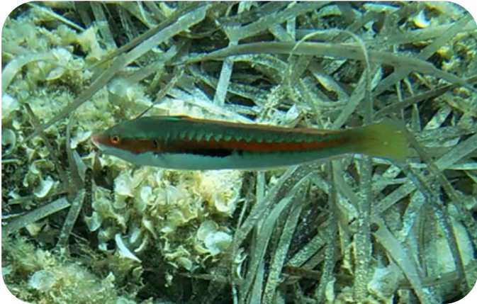
Rainbow Wrasse