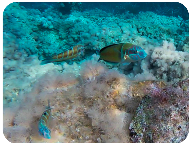
Ornate Wrasse

Ornate wrasses usually live in rocky areas where there is algae and Neptune grass, but they can sometimes also be found living in human structures like shipwrecks or piers. They can swim very fast using their pectoral fins, and at night they will burrow into the sand by shaking their tails.